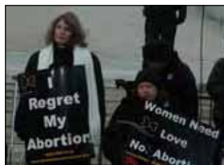
Jennifer O'Neill, Celebrity Spokeswoman for the Campaign

Here are some photos from the gathering at the US Supreme Court on January 22, 2007.