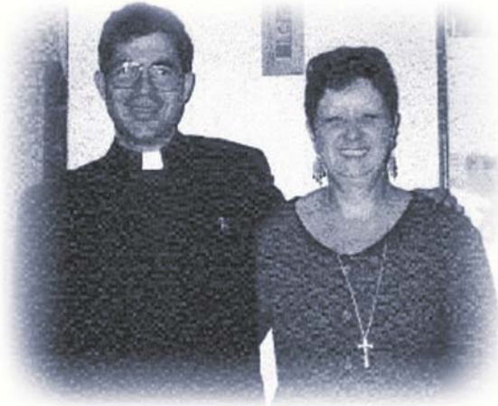
Fr. Frank Pavone with Norma McCorvey, the former “Jane Roe” of the Supreme Court decision Roe v. Wade . Norma is now pro-life, and Fr. Pavone received her into the Catholic Church in 1998.

Read more at www.AbortionTestimonies.com